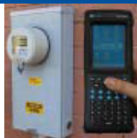
Automatic Meter Reading